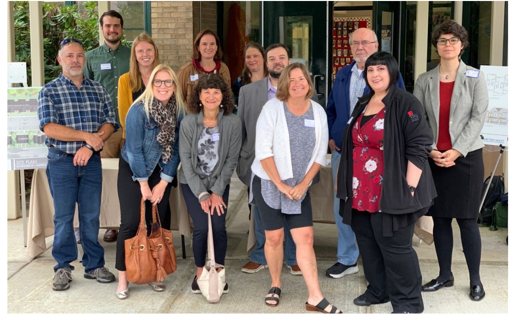
Members of Affordable Housing Trust, Select Board, and town staff at Open House

40 units of 100% affordable family rental housing available to households earning up to 60% AMI