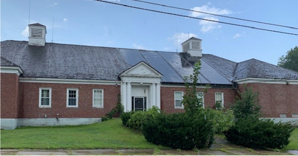
Vacant Police Station, 62 Packard Street

Motivation: AHT + Select Board member who saw a need to provide truly affordable housing in a gentrifying community; CPA $ in the bank; updated census #s coming.