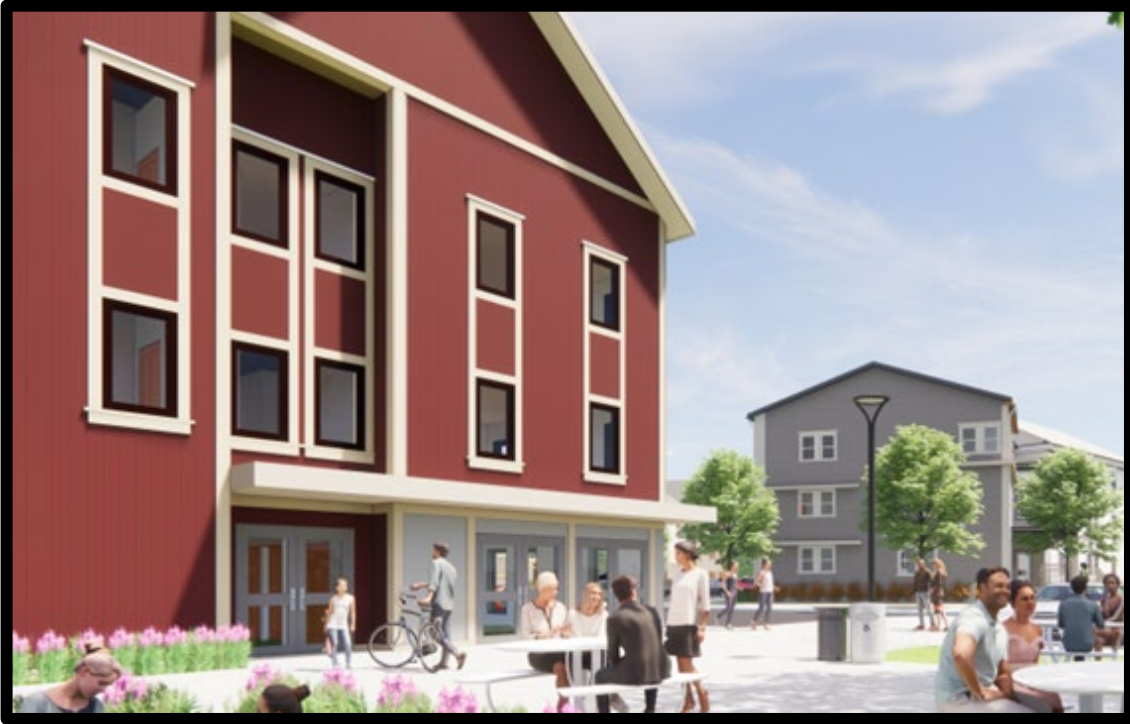
Rendering: Glen Brook Way Apartments Architect: Meander Studios

Motivation: AHT + Select Board member who saw a need to provide truly affordable housing for families and seniors, desire to play defense on 40B.