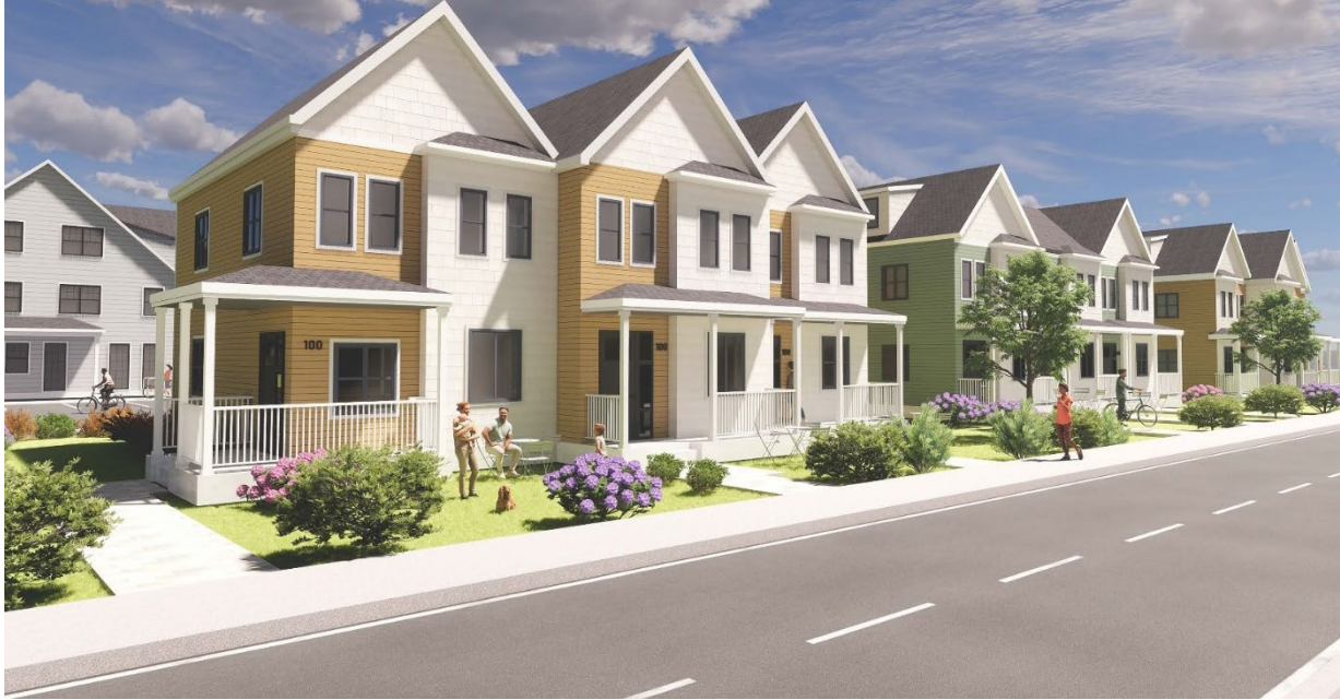
Proposed: New Construction Affordable Housing