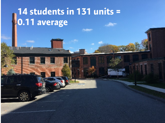
Princeton Westford (I) and Abbot Mill (r) in Westford, Massachusetts.

The monthly rents for market-rate units range from $1,780 to $2,535. Approximately 5 percent of the units are vacant and available for rent.<sup>3</sup>